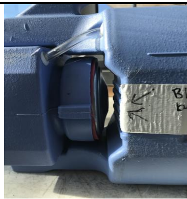
Figure 2: Room fogger - filter block not installed (gap)