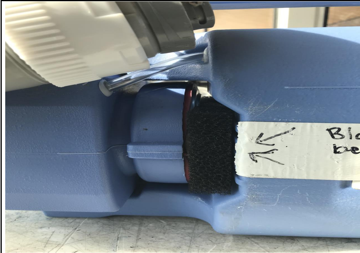
Figure 4: Room fogger - filter block installed (no gap)