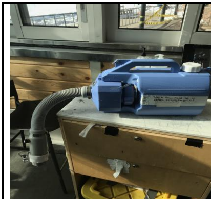
Figure 1: Room fogger